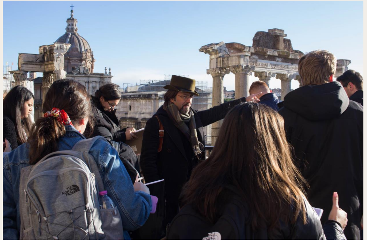
Art History at the Capitoline Museum (Jan. 2020)