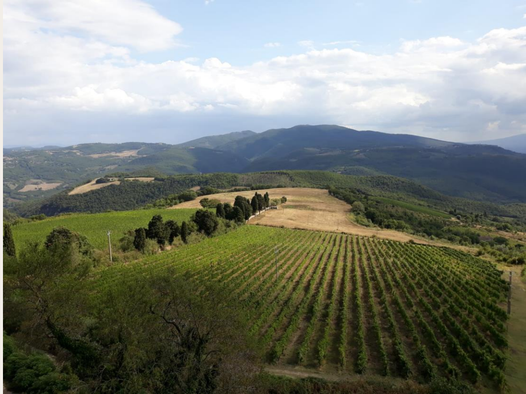
Day trip to Todi/Titignano