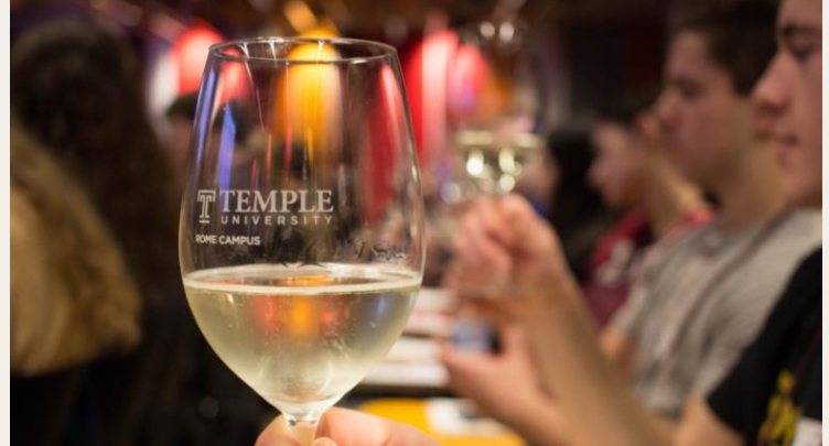
Above: Cooking Class Below: Wine Tasting (2019)