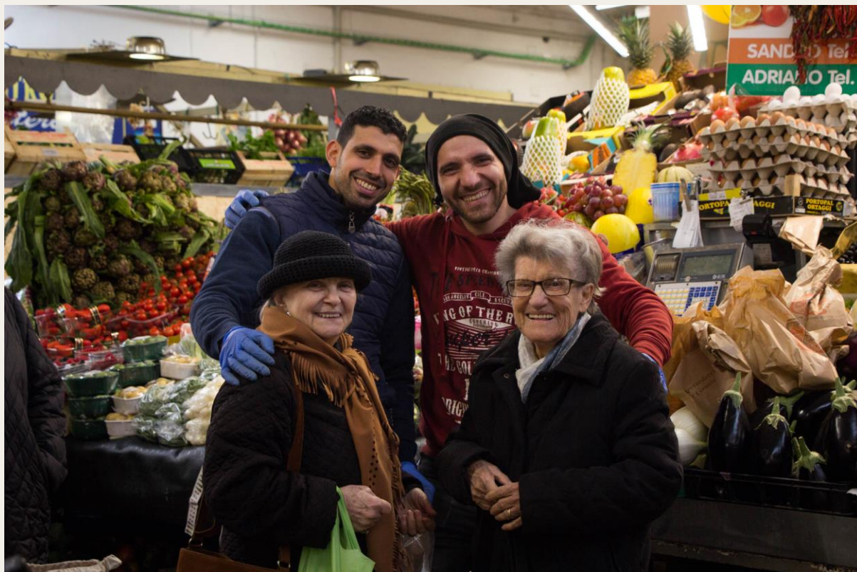
Italian Markets Cultural Lab (Jan. 2020)