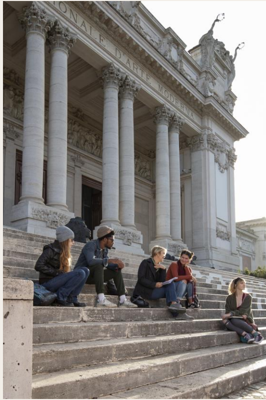
Rome Sketchbook at the Modern Art Museum (2018)