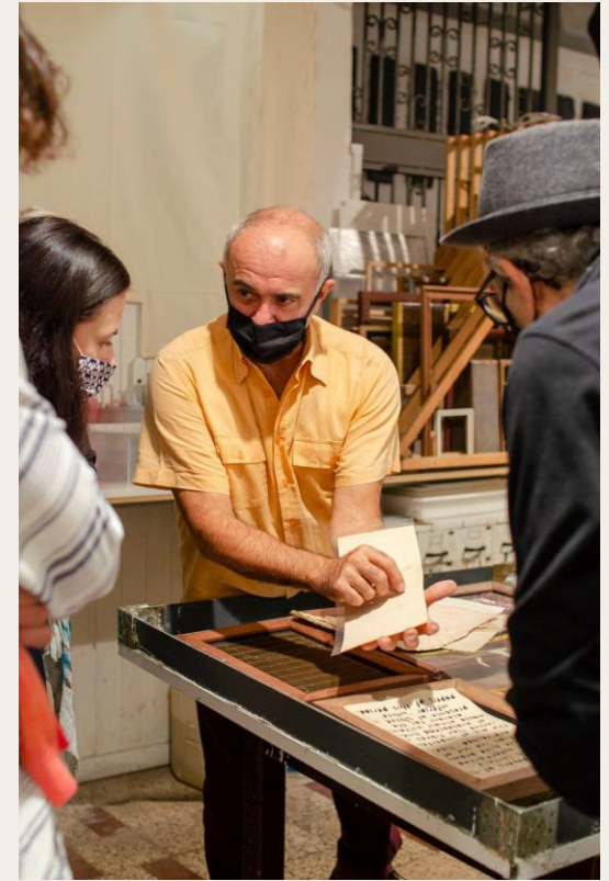
Papermaking in Rome (2020)