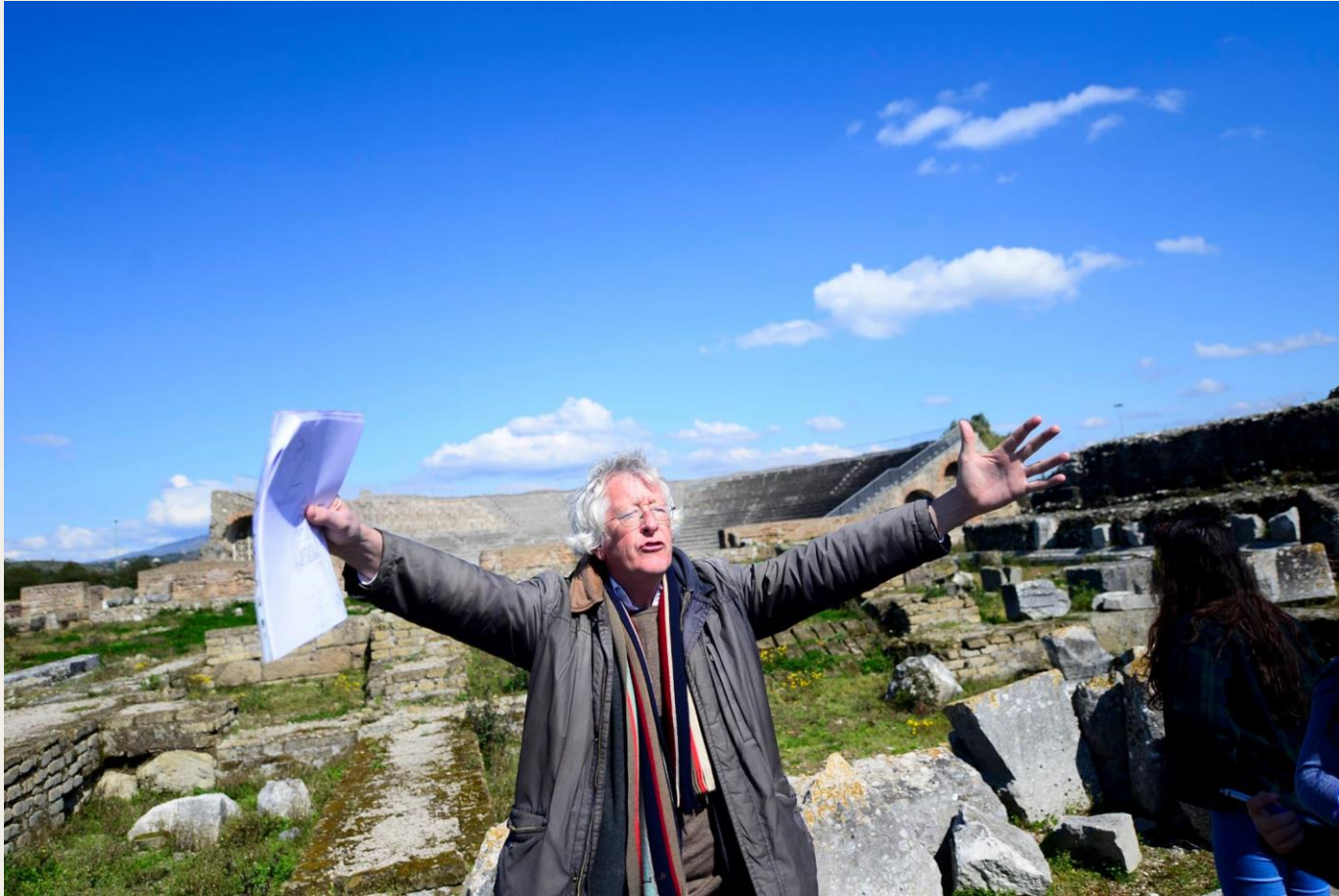
History and Classics excursion to Pompeii, Paestum, and Naples (2016)