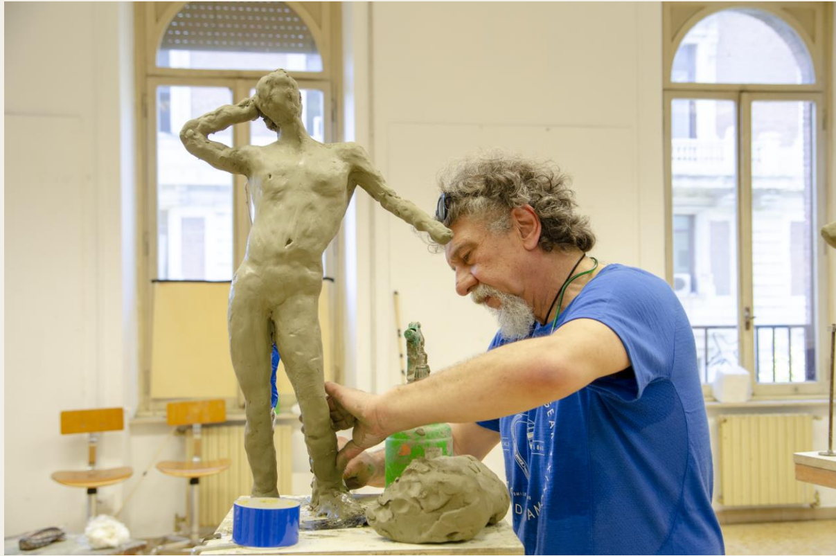
Figure Modeling in Rome (2019)